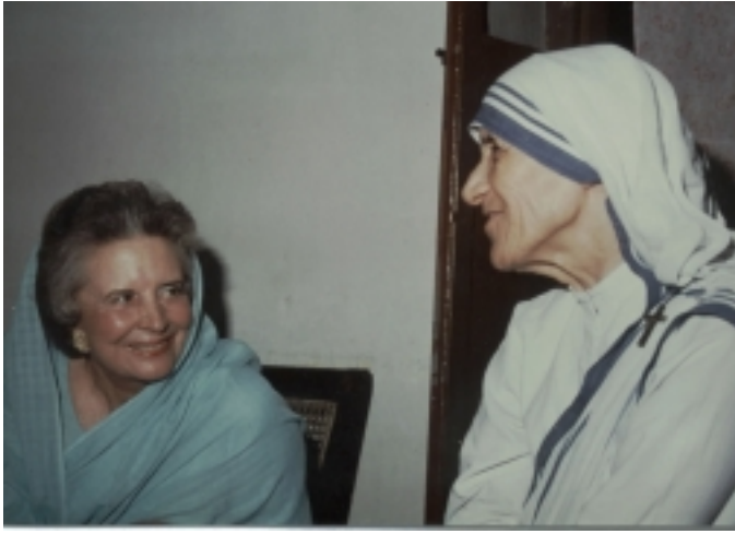
Mother with Mother Teresa in Calcutta

and cut down and bring to our living room and decorate with bright tinsel ornaments, but we will decorate our own trees of life, our bodies, with the jewels of love, of peace, of wisdom, of power. And we will bring forth such beautiful gifts, such as we listened to, such as we saw last night, that we scarcely will be able to contain it.