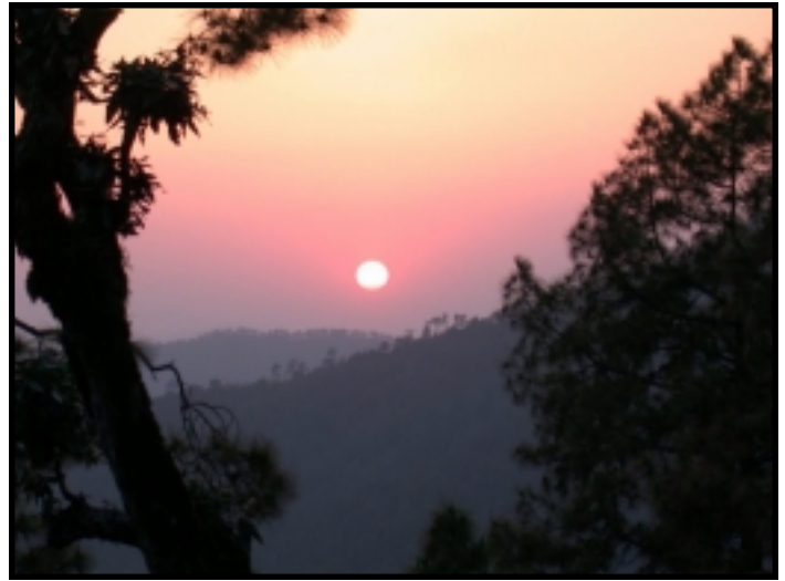
Sunset in the Himalayas

"Remember what we are doing is not social work. We are touching the face of God." - Mother Teresa