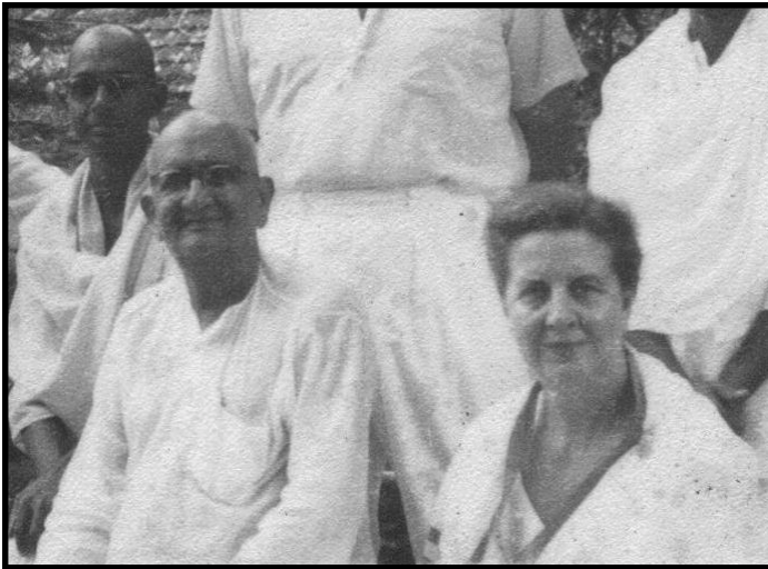
Swami Satchidananda, Papa and Mother Hamilton at Anandashram in 1957