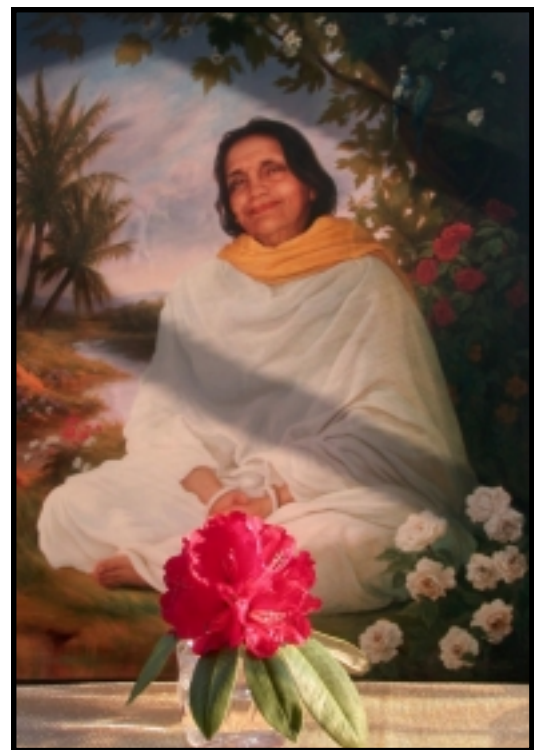
The Divine Mother, Anandaamoyee Ma

A delightful and profound "introduction" came to me regarding Anandamoyee Ma. In the past I felt a great veneration for Ma, but I had no direct experience with her. While at Anandashram two devotees of Ma's directed me to some of her ashrams in the Himalayas. At her ashram in Almora I asked to be let into a room Ma had used during her stays there. When they opened the locked door I stepped into a room that had an effect so powerful that it was like entering into an ocean of Bliss. My heart opened into ever expanding