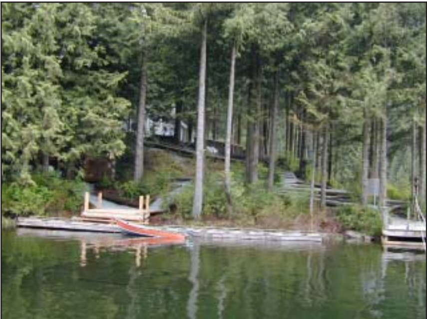
A view from the hand operated ferry