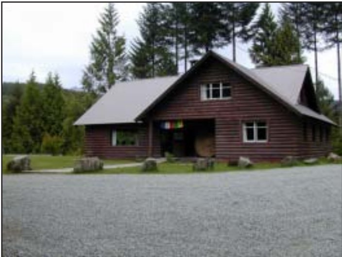
Main Building for Retreat