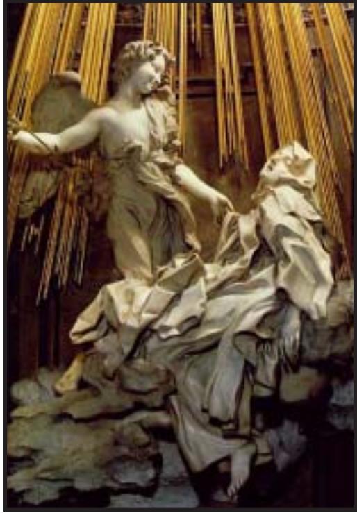
“The Ecstasy of St. Teresa” by Gianlorenzo Bernini

About 1560, at the age of 45, Teresa expanded her own spiritual development to include the return of the Carmelite Order to the stricter rule of its beginnings. A small group of sisters formed around her at that time and in 1562 she opened her first reformed convent, St. Joseph of Avila. Other convents and monasteries soon followed, always with difficulty and considerable resistance. In 1567 she convinced St. John of the Cross (see the March, 2003 edition of this Journal) to join her movement.