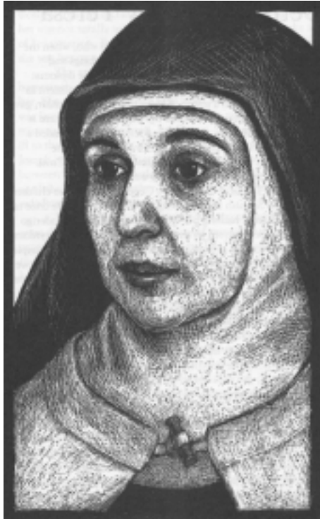
St Teresa - Engraving

Mother Teresa of Jesus, now known as St. Teresa of Avila, was born Teresa Sanchez Cepeda Davila y Ahumada in Avila, Spain on March 28, 1515. She died in Alba on October 4, 1582. In historical context, she was born less than 20 years after Columbus discovered America, lived during a time when Spain was at the height of its power and wealth, and died six years before the destruction of the Spanish Armada by the British navy in 1588. Indeed one of her brothers died fighting for Spain in Chile.