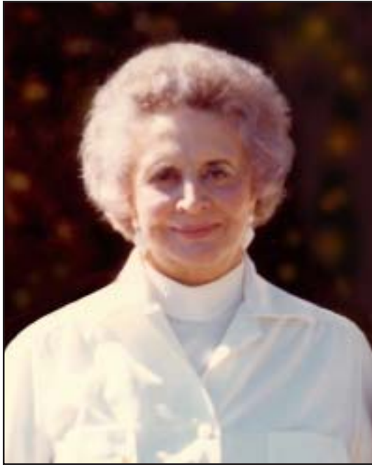
Mother Hamilton in 1976.