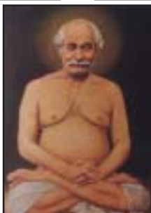
Lahiri Mahasaya Birthday Sept. 30, 1828 Mahasamadhi Sept. 26, 1895