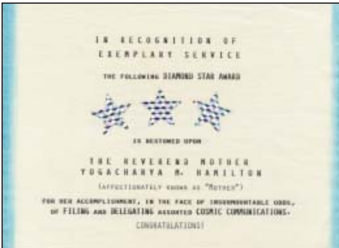
Humor From Mother's Files