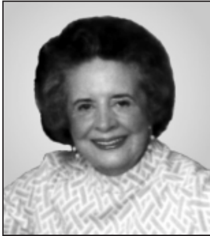
Mother in 1975