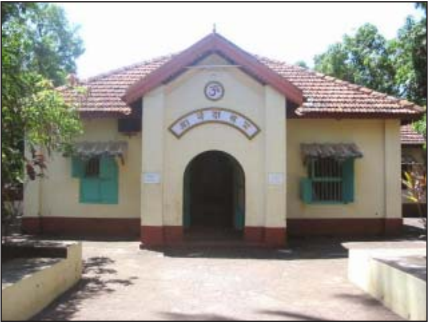
Bhajan Hall, Anandashram