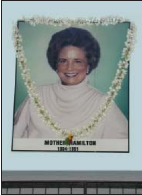
In the Canteen at Anandashram, Mother's picture is garlanded in honor of her Mahasamadhi Day, January 31, 2006.