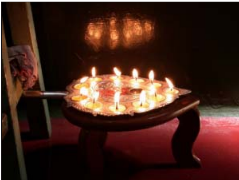
Arati Light in the Bhajan Hall at Anandashram