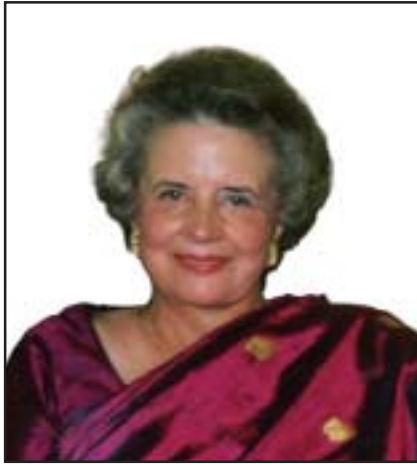
Mother in 1977 in India