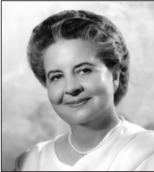
Mother in the 1960s