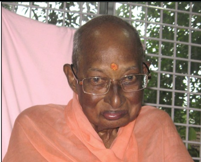
Our Beloved Swamiji, H.H. Swami Satchidananda—a recent photo. He will celebrate his 89 th birthday on November 12 th .