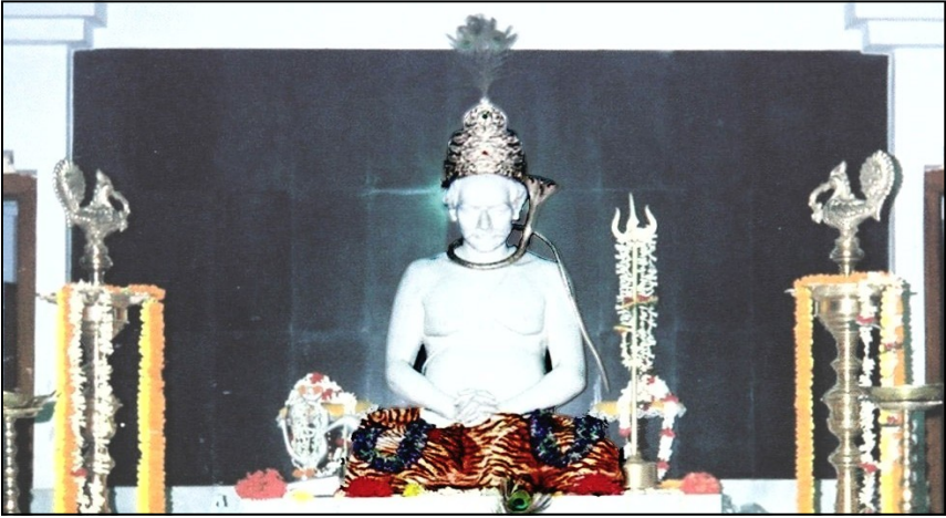
Statue of Lahiri Mahasaya at Yogiraj Shyam Charan Sanatan Mission