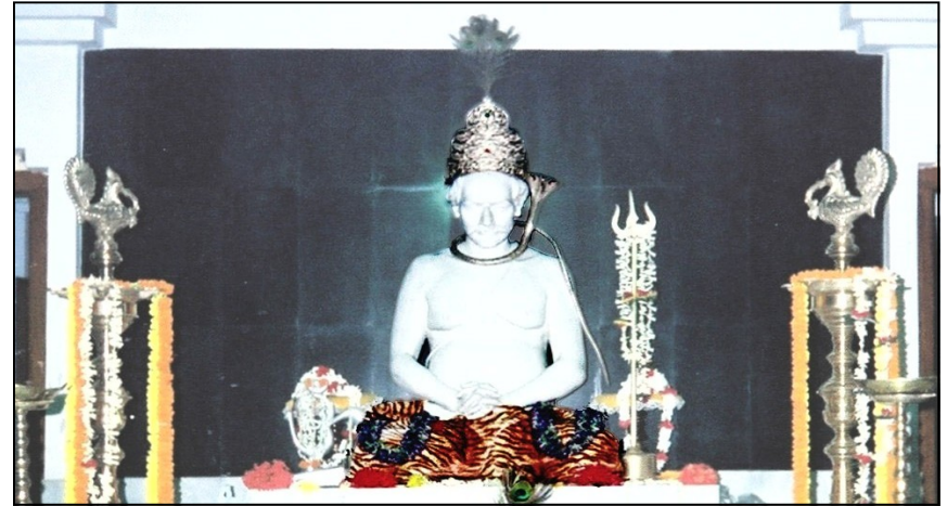
Statue of Lahiri Mahasaya at Yogiraj Shyam Charan Sanatan Mission

I think that reincarnation has very definitely been established as a fact today. There have been many who have regressed into former incarnations, many who have had visions when they are lifted up into the final experience where they are trying to attain their Oneness with God; and God, for His own plan and purpose,