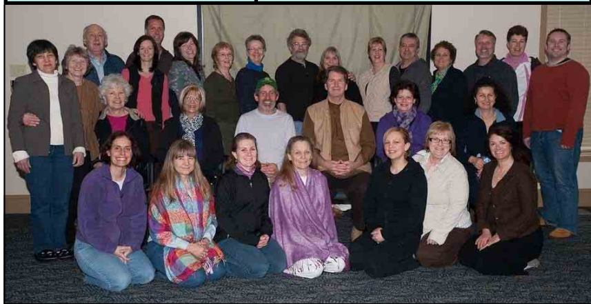
Loon Lake Retreat - March 2009