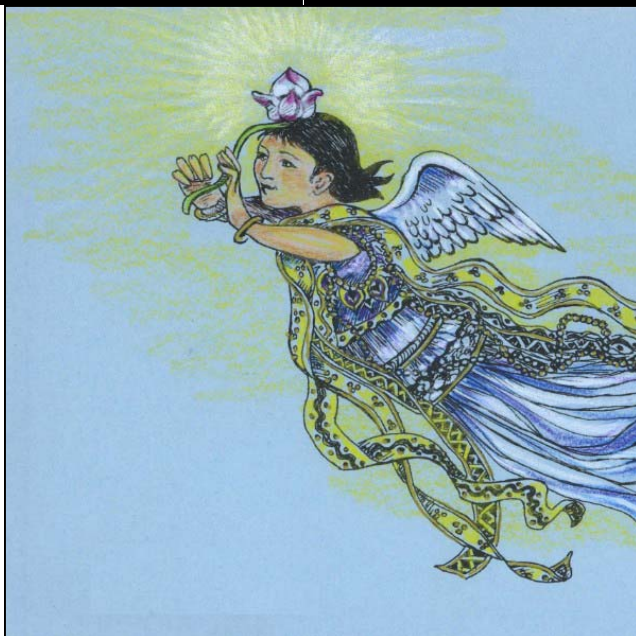
By Lorraine Bourcier