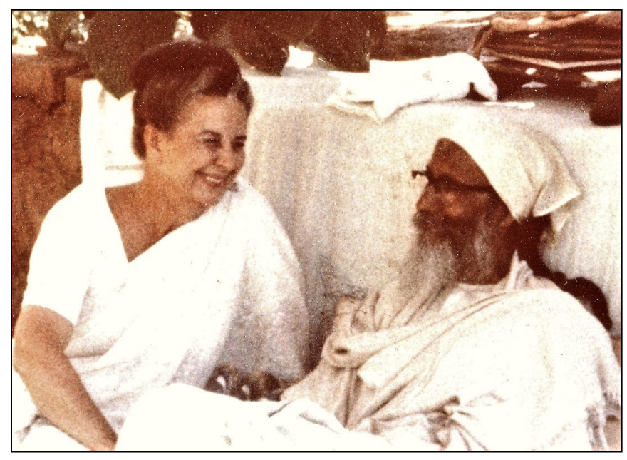
Mother with Swami Ashokananda in Kashmir, 1968

[Taken from the talk, "Theology versus God-realization" given by Mother on September 7, 1975.]