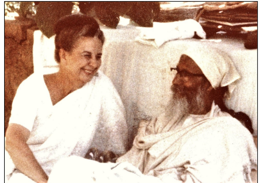
Mother with Swami Ashokananda in Kashmir, 1968

[Taken from the talk, "Theology versus God-realization" given by Mother on September 7, 1975.]