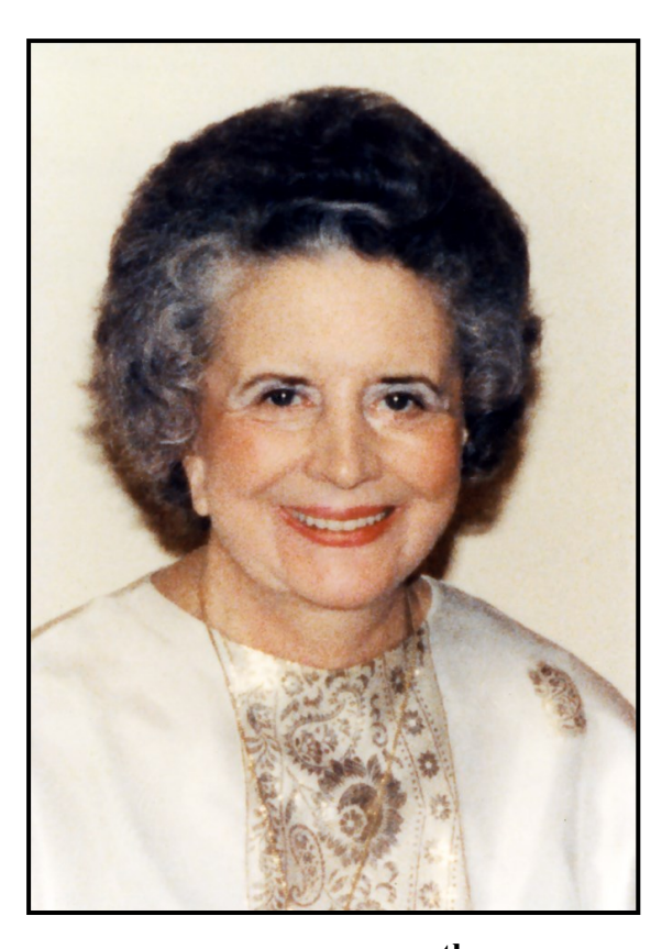
In Celebration of the 30<sup>th</sup> Anniversary of Mother's Mahasamadhi